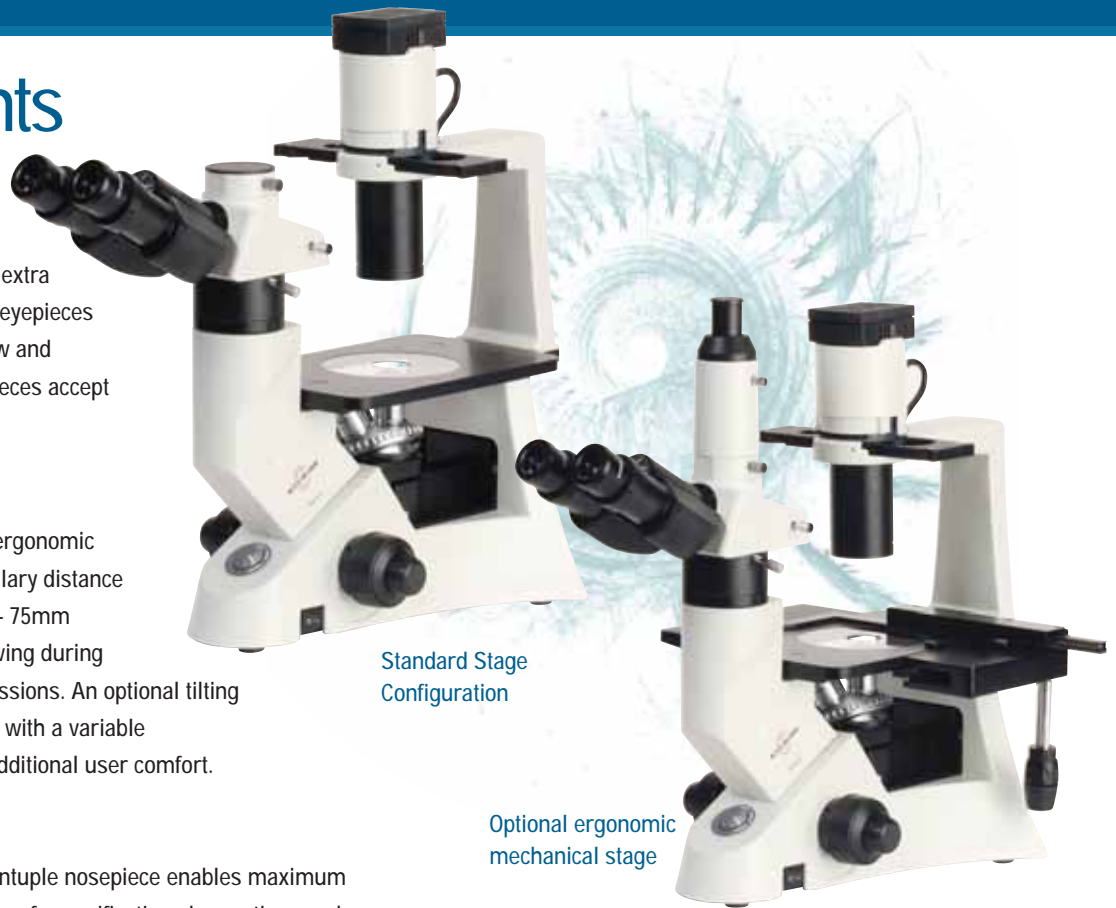
Standard Stage Configuration

An optional ergonomic mechanical stage with low position right-hand controls is available. Stage movement is 120mm (X) by 78mm (Y). These optional specimen holders are available for use with the mechanical stage: Teraski holder (accepts Ø65mm petri dish), Ø35mm petri dish holder and a slide glass holder (accepts Ø54mm petri dish).